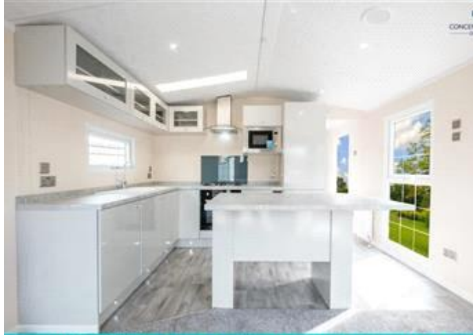
Not Suitable for Private Dwelling - Property Investors Only