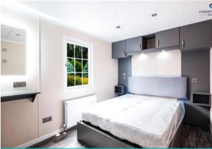
Not Suitable for Private Dwelling - Property Investors Only