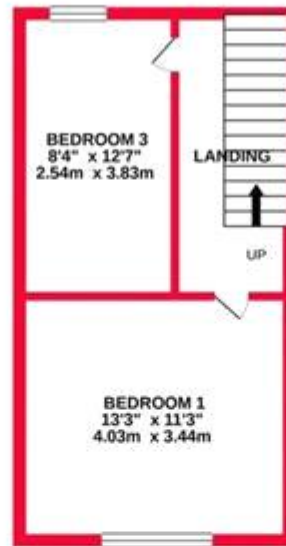
1ST FLOOR 303 sq ft. (28.2 sq.m.) approx.