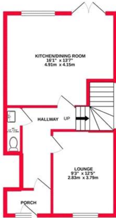
GROUND FLOOR 435 sq.ft. (40.4 sq.m.) approx.