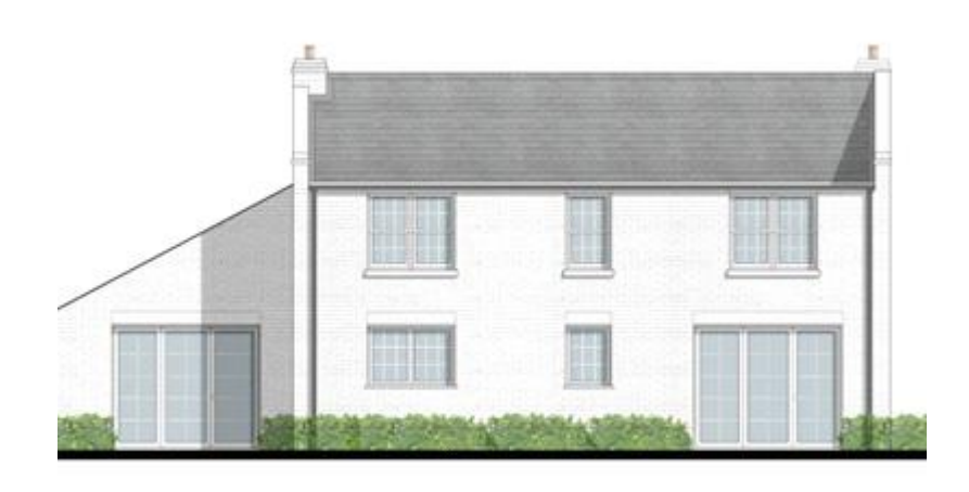
'ROPOSED REAR ELEVATION